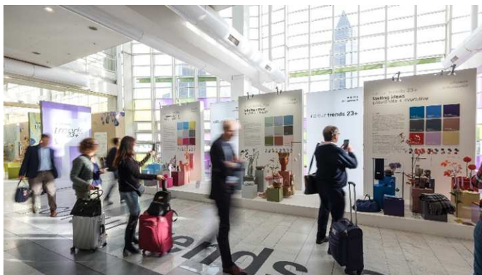
As a central source of inspiration on the relevant themes, colours and materials for the coming season, Christmasworld Trends 23+ in the Foyer of Hall 4.1 met with great interest.

The Christmasworld Trends 23+ trend area, staged by the Bora.Herke.Palmisano style bureau, was a particularly strong crowd-puller at Christmasworld. In future, the focus will be on classic and, at the same time, surprising designs and natural, sustainable decorations.