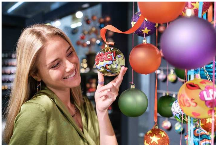
Bang! Christmasworld is back with a new concept and convinces across the board. The wow-experience of Christmas and seasonal decorations moved into the East Exhibition Grounds in 2023 and delighted around 35,700 shoppers.

Frankfurt am Main, February 2023. Christmasworld returned successfully in a new format parallel to Ambiente and Creativeworld and with a new hall layout in the East Exhibition Centre, including the newly inaugurated Hall 5. 35,719 trade buyers – 71 percent of them from abroad – were in an excellent ordering mood and enthusiastic about the new variety of products. 627 exhibitors were delighted with full order books and many new international contacts. Together, they embark on the new business year strengthened and optimistic.