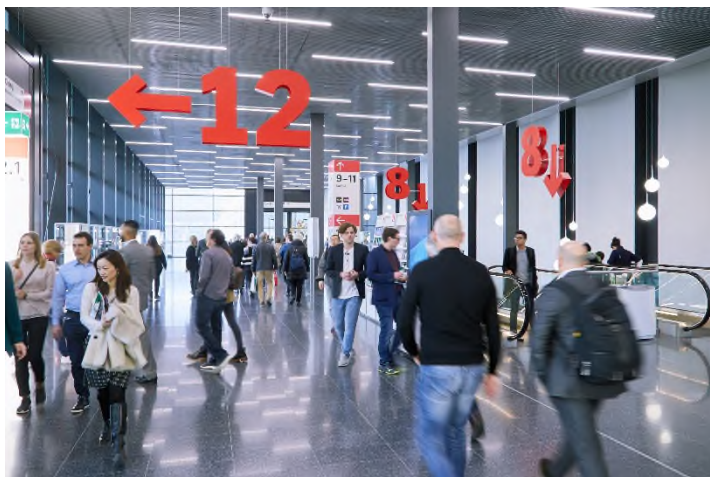
The consumer goods world back in Frankfurt.

As the leading international consumer goods fair, Ambiente reflects the changes in the market in a future-oriented way. It presents a unique mix of ideas and products - and is the international platform for meeting customers from all over the world. In the Dining section in Halls 8 to 12 in the West Area, Ambiente is the big stage for everything that makes cooking and household chores easier and food more enjoyable. Exhibitors such as Cristel, Dibbern, Robbe & Berking, RAK, Rosenthal, Wächtersbach and Villeroy & Boch Hospitality bring glamour and variety to the table.