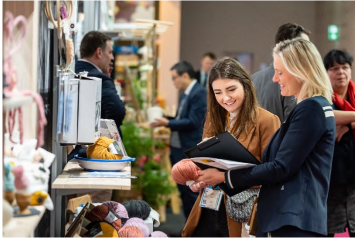
Ambiente and Christmasworld will start on 3 February 2023, Creativeworld on 4 February 2023 at the Frankfurt exhibition centre.